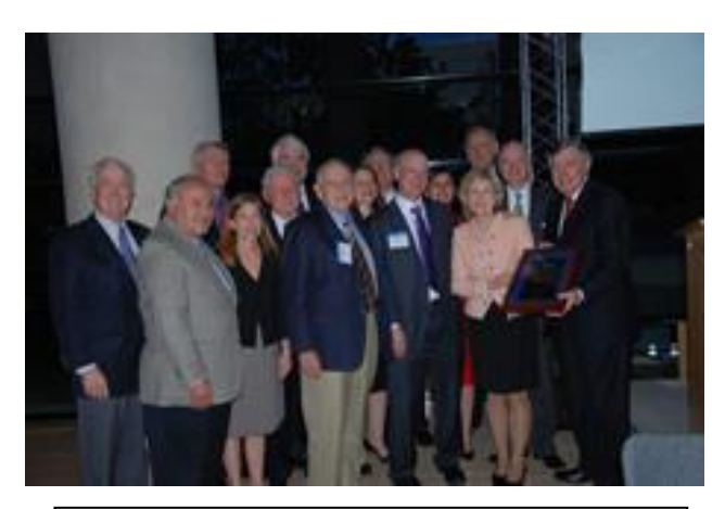
Senator Hutchison honored on April 17, 2012 with the American Bar Association Congressional Justice Award.

The Texas Access to Justice Commission prepared three teams of Texas lawyers, who met with 31 Texas Congressional Offices, including 18 elected officials, to discuss the need for Legal Services Corporation (LSC) funding.